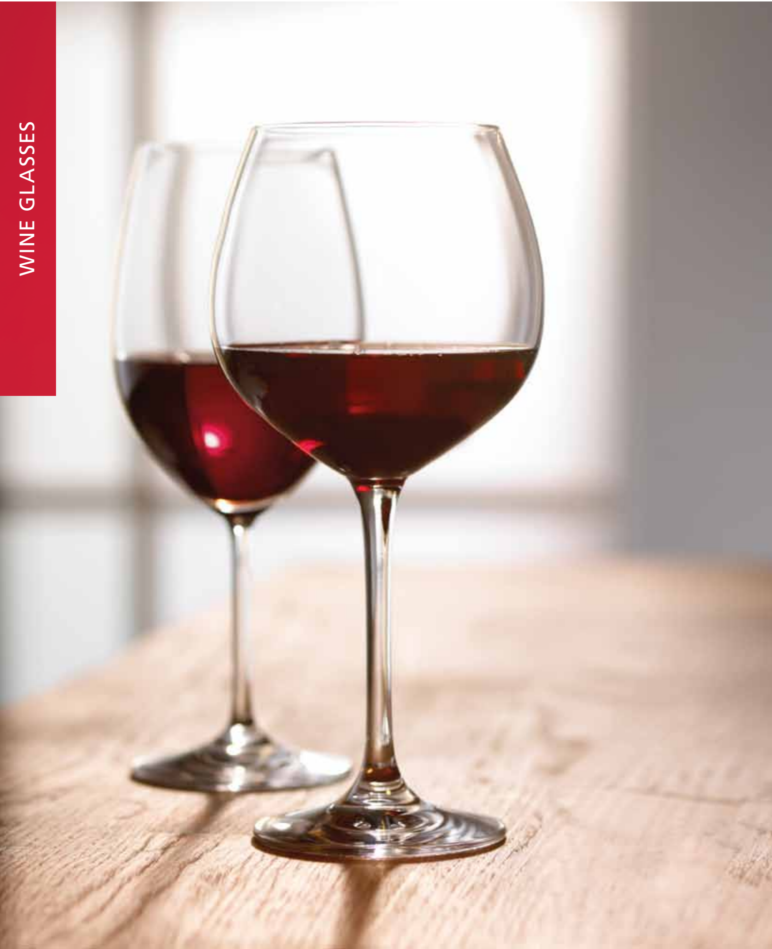
Winebar 64 Bordeaux