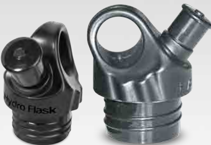
NARROW MOUTH SPORTS CAP STANDARD MOUTH SPORTS CAP

Going to be traversing a crevasse or forging some white water? Then our Sports Caps were designed just for you. The convenient pop top makes drinking on the go a piece of cake. The flow is great and the attachment loop makes it easy to clip your Hydro Flask to just about anything under the sun. The Narrow Mouth Sports Cap fits our 18 oz and 24 oz Narrow Mouth bottles and the Standard Mouth Sports Cap fits our 12 oz and 21 oz Standard Mouth bottles.